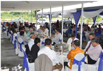
AIDILFITRI CELEBRATION AT PORT KLANG AUTHORITY 18 JULY 2017