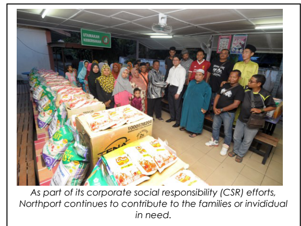
As part of its corporate social responsibility (CSR) efforts, Northport continues to contribute to the families or individual in need.

The program is part of Northport's CSR initiatives in reaching out and giving back to the community, to fulfil its commitment as a responsible corporate citizen especially during Malaysia's major festivals.