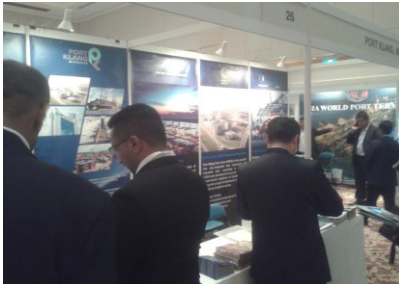
15 TH ASEAN PORTS AND SHIPPING , MYANMAR CONFERENCE & EXHIBITION, MYANMAR 5-6 JULY 2017