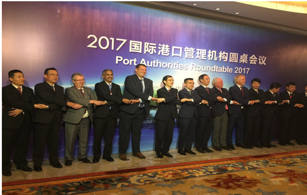
Head of delegations from 14 organisations at the Port Authorities Roundtable were discussing and sharing ideas on addressing key issues of mutual interests