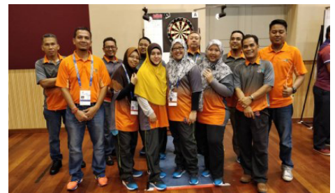
SUKAN BADAN-BADAN BERKANUN (SUKANUN) 21-27 JULY 2017