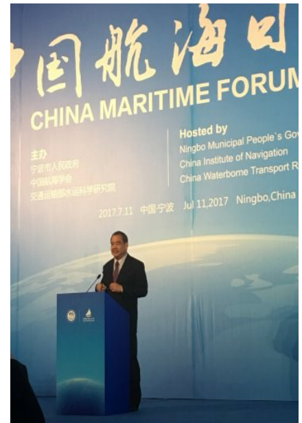
PKA Chairman, YBhg. Tan Sri Dato Seri Kong Cho Ha delivers his keynote speech at the closing ceremony of China Maritime Forum in Ningbo, China recently.

"To further strengthen the cooperation and exchanges with countries and regions along the Belt and Road"